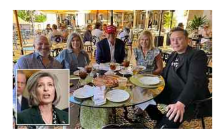
The 22 surprising ways Musk and Vivek's DOGE can slash one TRILLION