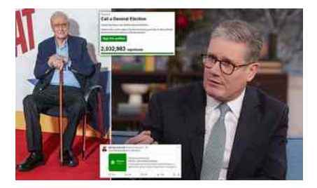
Now acting legend Michael Caine backs election petition

The veteran journalist hit back at Musk for using his platform, X, to distribute his '300 words of cleverness,' branding it 'bullsh**'