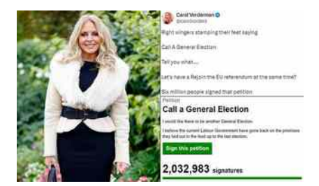
Carol Vorderman condemns petition calling for fresh general election